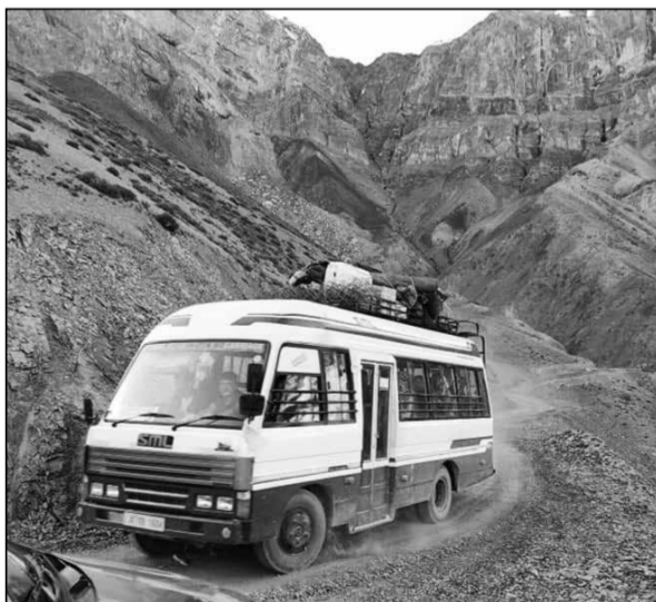
Trans Singay-La area gets its first ever public transport; District Administration Leh in cooperation with Mazda union Leh started public transport to Trans Singay-La from August 25.