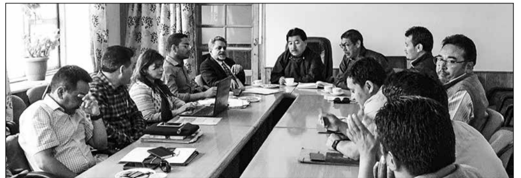
Discussing the potential and scope of Animal Husbandry sector in Leh.

Aims to study potential and scope of animal husbandry sector