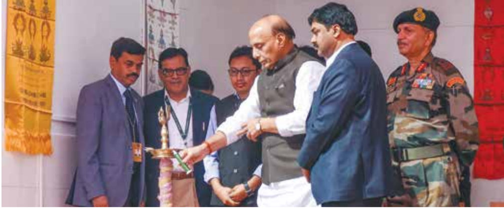
Rajnath Singh, Defense Minister of India while inaugurating the 26th Ladakh Kisan-Jawan-Vigyan Mela