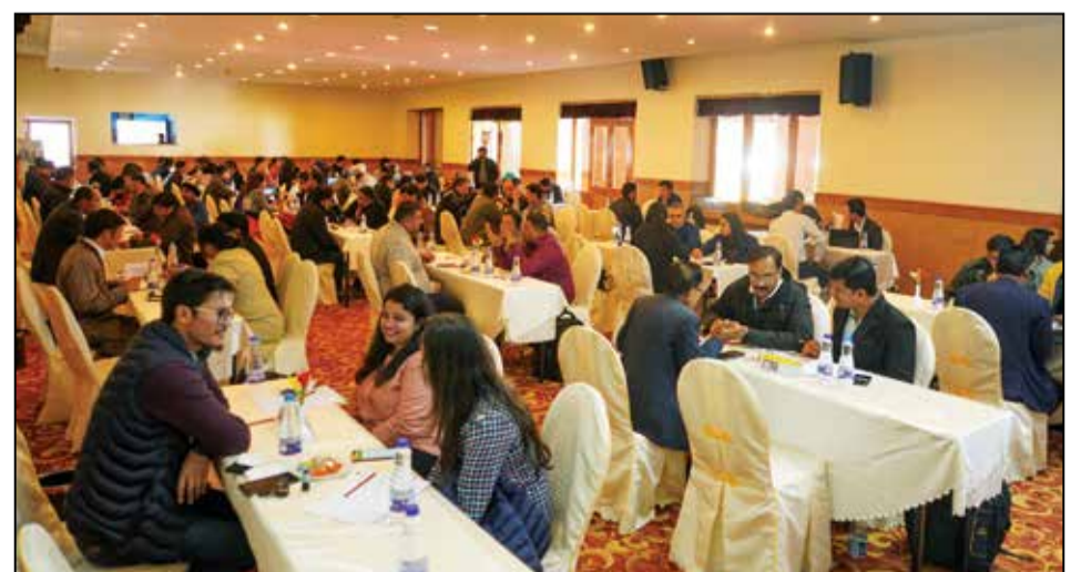
Travel professionals during the B2B session during EDWIN Ladakh 2018.