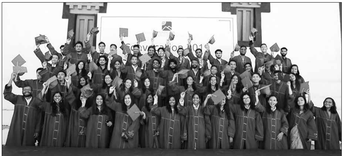
Convocation ceremony of 1st Naropa Fellowship; 52 young fellows from India, Nepal and Bhutan completed their one year residential post graduate programme on August 25.