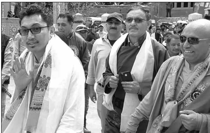
Jamyang Tsering Namgyal, MP Ladakh attending the two day Aryan Festival in Hanu Yokma. He congratulated the people of Brokpa tribe for celebrating Aryan Festival in UT Ladakh.