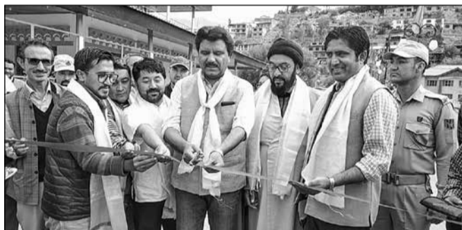
Feroz Ahmed Khan, CEC, along with other dignitaries during the occasion.