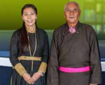
Guest: Thupstan Chhewang, Former MP Don't forget to watch and subscribe to our channel

Reach Ladakh's show 'The Reality' དྲི་ཅ་ལ་དྲུག་ས་གསལ་ Episode # 2 will be releasing on 7th September (Saturday) in between 5:00 - 6:00pm on 'Reach Ladakh' Youtube channel.