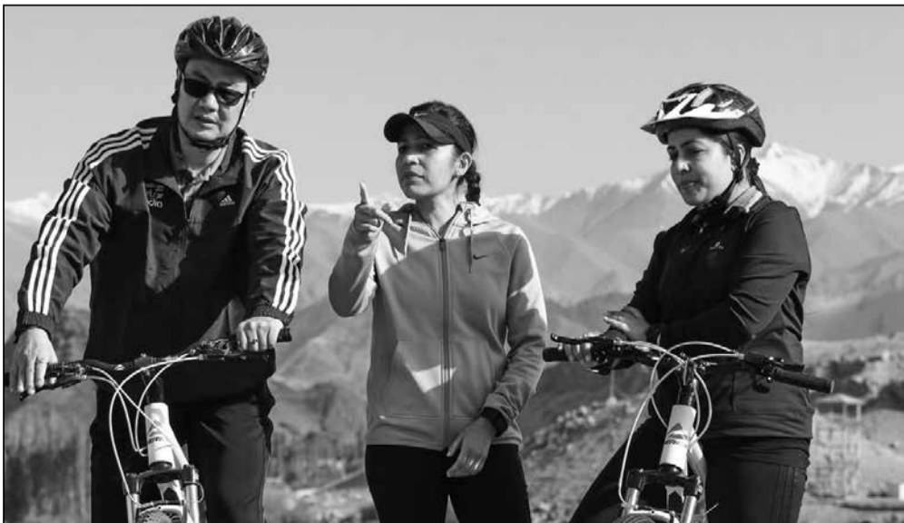
Sports Minister Kiren Rijiju, Avny Lavasa, DC, Leh and Sargun Shukla, SSP, Leh during the early morning cycling session in Leh.