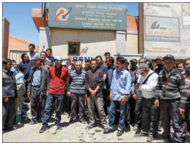
Daily wagers of Bharat Sanchar Nigam Limited (BSNL) protesting outside the office in Leh.