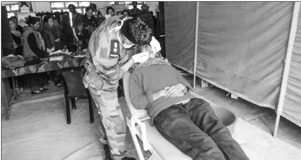
A dental patient getting treatment during a Medical camp organised by Fire and Fury Gunners as part of Operation Sadbhavna in Hemishukpachan.