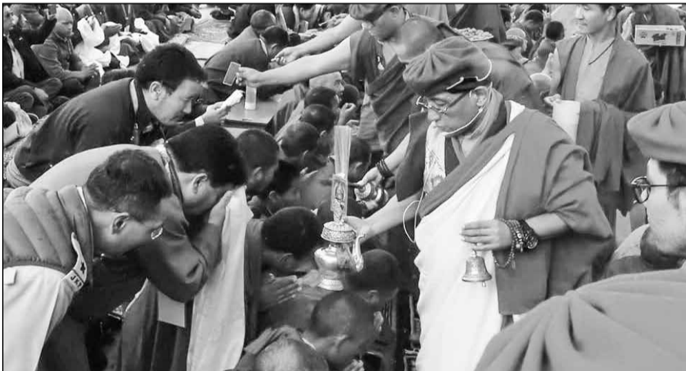
His Holiness Gyalwang Drukpa Rinpoche blessing the devotees during a conferment of three days teaching in Nyoma Changthang.

“ Art is an integral part of our culture. From the making of our traditional attire to jewellery, local cuisines to folk song and dance, thanka painting to building monasteries are all art which involves our emotions, ideas and much more. Art surrounds life, it's not a new subject, it's the most basic and common thing we share. ”