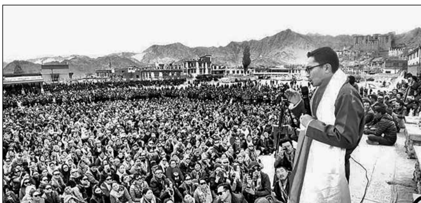
After winning the MP Ladakh seat, BJP Leh celebrating the grand victory at Polo Ground.