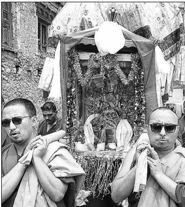
Ladakh Monlam Chenmo the congregational prayer for the world peace & harmony organised by All Ladakh Gonpa Association.