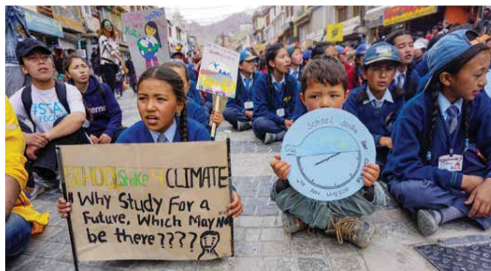
A child of five years taking part in the environmental rally.