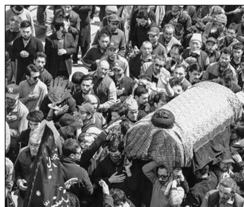
Thousands of people participated in the procession of the Martyrdom of Hazrat Imam Ali in Kargil.