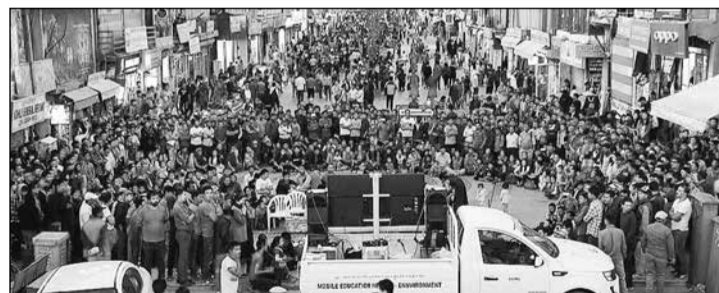
Ladakh Heart Foundation screened a documentary film titled 'Foe in Phayul' to raise awareness of plastic waste at Leh market on May 23.