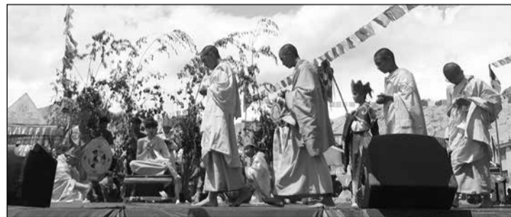
Students performing a skit on Life of the Buddha during the Buddha Jayanti celebration in Leh.