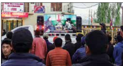
Documentary screening in the main market.

He further added that the Govt and NGO's are working together to educate and implement sustain-