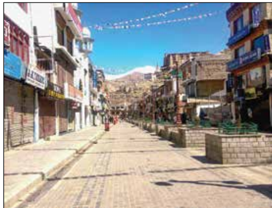
Condemning the murder incident, market remained closed for one day.

Section 34: Acts done by several persons in furtherance of common intention