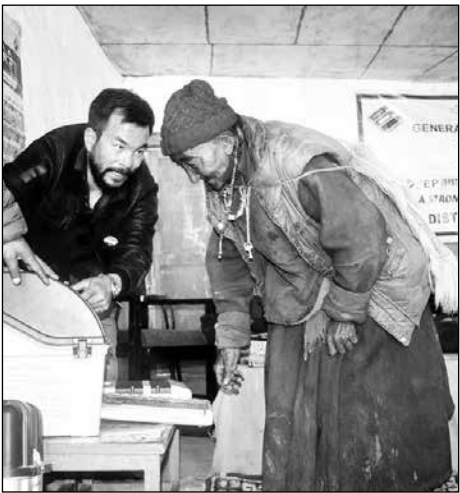
SVEEP team educating people about the voting rights and making them familiar with the EVM & VVPT machines.