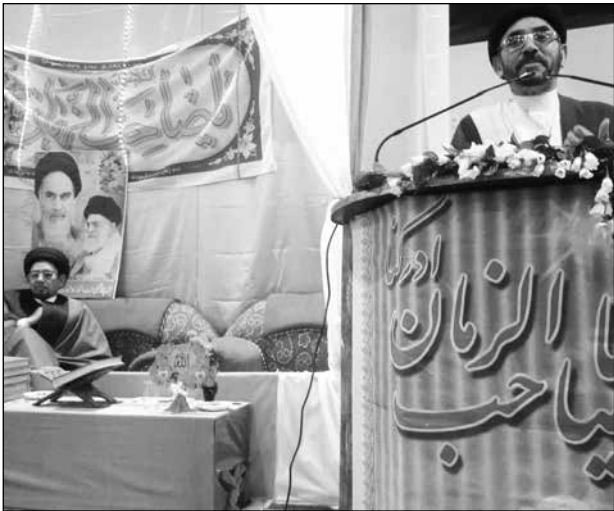
Shab-e-Barat, birth anniversary of Harzat-e-Imam Mehdi (A.S) celebration in Sankoo, Kargil.