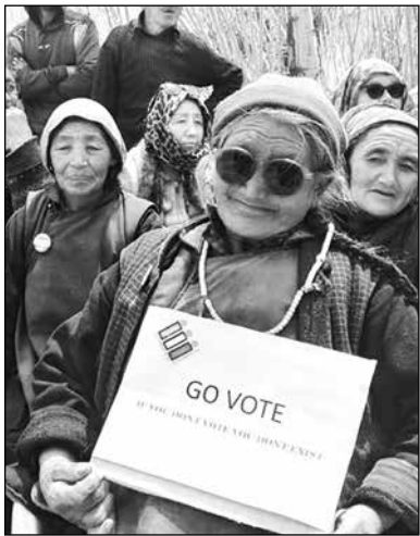
Elderly woman of Nubra appealing to vote during the voter awareness campaign at Tangyar & Kyagar.