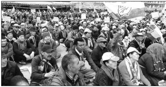
Public gathered during the Congress mega rally at Pologround, Leh

BJP has failed to fulfil the promises made during last election, says Jora