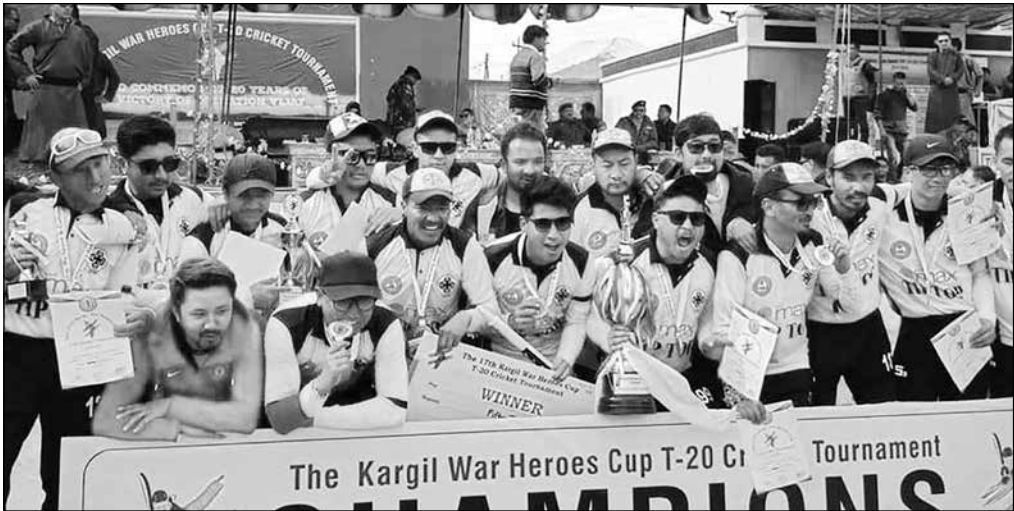
Tip Top club lifted the 17th Kargil War Heroes Cup 2019 cricket tournament.