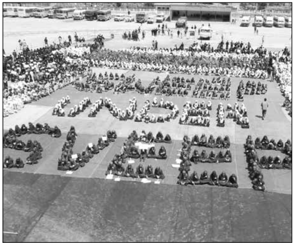
Mass awareness campaign themed, "Sweep under SVEEP" for voters participation along with inculcating the habit of cleanliness and waste segregation at Khree Sultan Chow Sports Stadium, Bemathang.