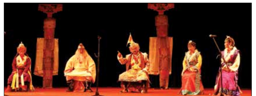
Artist of play Horling staged during World Theatre day.

Theatre is a means that develops the body, speech and mind of an individual, says Mipham Otsal