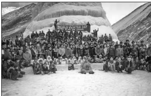
Village Shara Phuktsey won 1st Prize in Ice Stupa competition.