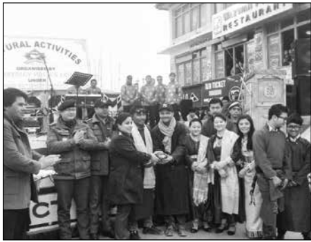
District Police Leh organised a cultural show under Civic Action Programme on March 29 at Main Market Leh.