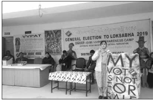
SVEEP awareness programme held at different villages and schools of Turtuk and Panamik.