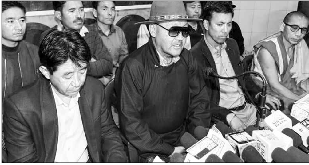
All Party Coordination Committee addressing the media.