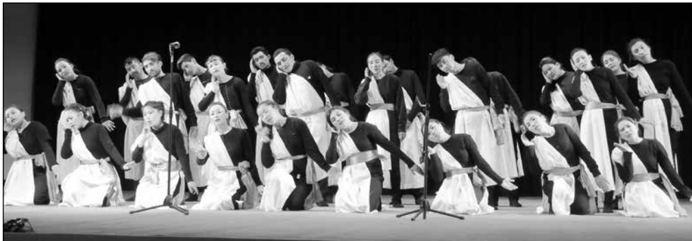
Students staging the play 'Khoj' on World Theatre Day after participating 20 days theatre workshop organised by J&K Academy of Art, Culture and Languages, Leh