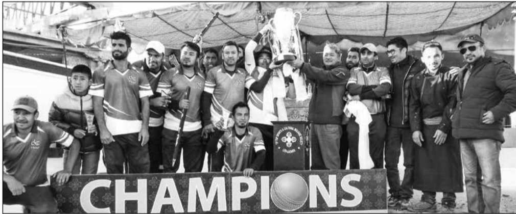
Leh United, the winners of the 3rd Tip Top T20 Champion League 2018.