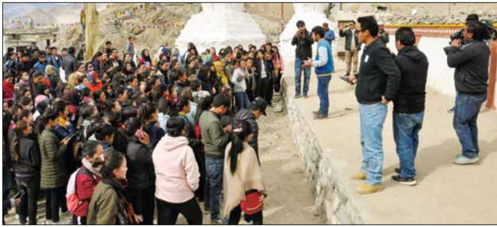
Students of Ladakh demanding a university in the Ladakh region in Leh.

Kashmir has 6 universities and Jammu 7, but none in Ladakh, says President, ALSAJ