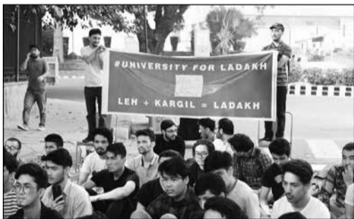
Protest demanding full-fledged University for Ladakh by Ladakhi students on 4 November 20 at Sansad Marg, New Delhi.