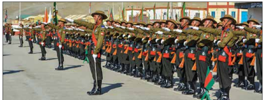
Young recruits of Ladakh Scots while taking the oath to serve the nation during the Passing Out Parade at Guphuks.