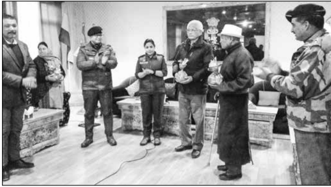
District Police Leh while honouring the survivors of Hot spring ordeal of 1959 at Police Line, Choglamsar.