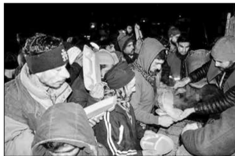
Barsee-e-Imam Baqirya Health Care & Research Centre, Kargil distributing food, water & medicines to stranded passengers at Leh-Srinagar National Highway.