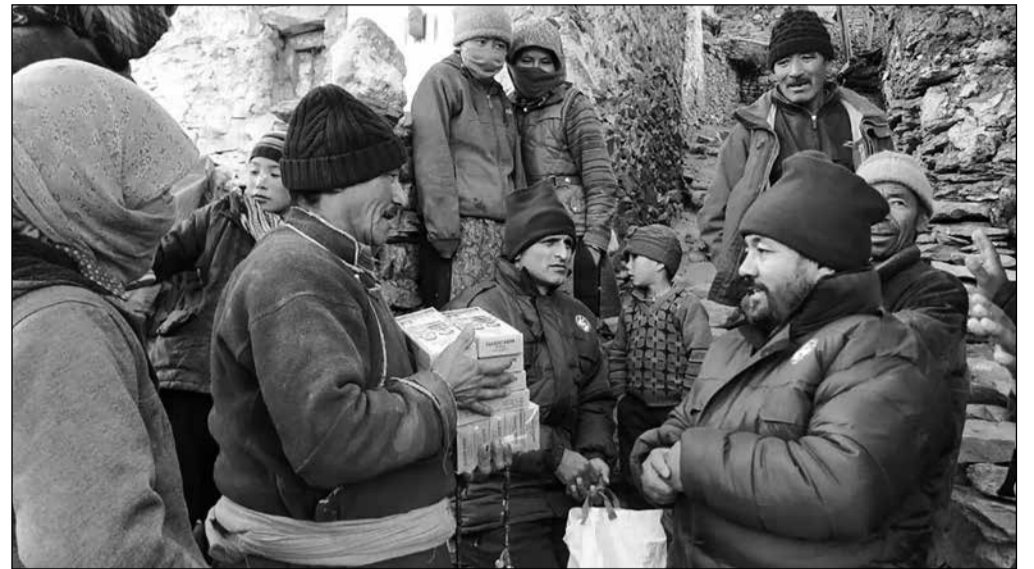
Wildlife Department distributing firecrackers among the villagers to drive away brown bears and snow leopards.