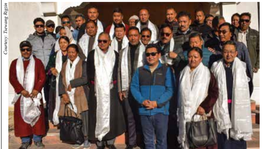
The 13 newly-elected members during the oath-taking ceremony held at the DC Conference hall.