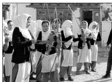
Young girls participating in archery during the 10 days coaching camp followed by 3 days open tournament Sports for Peace and Development under Khelo India scheme 2018.