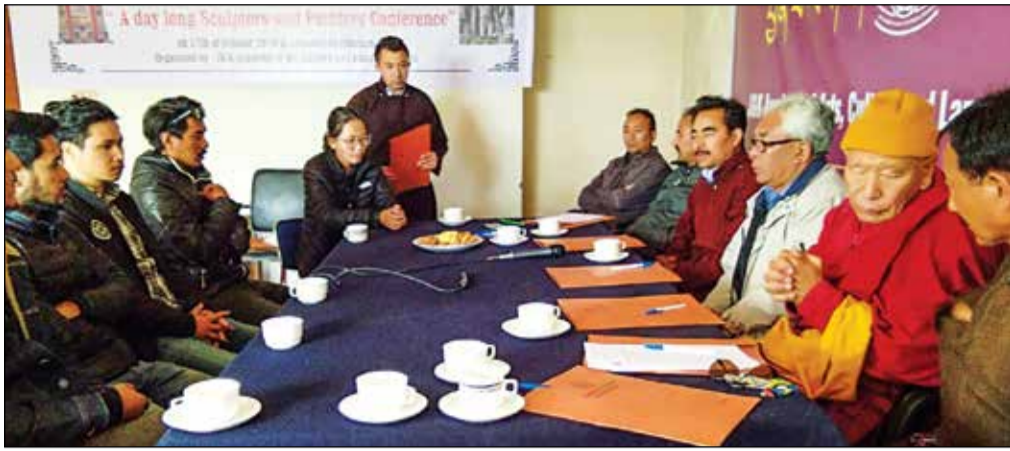
Traditional and modern artist during the discussion.