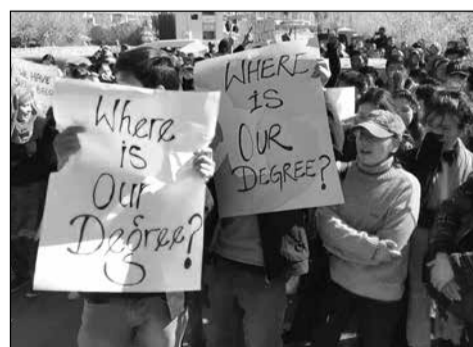
Kashmir University turn deaf ears; students of EJM College protesting against the delay in issuing degree to the students.