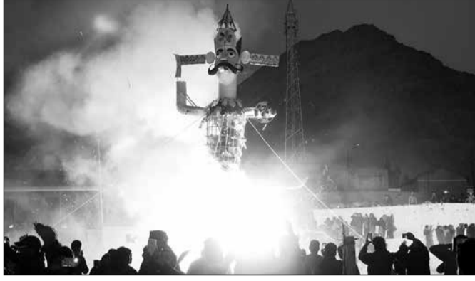
Demon king Ravana in flame during Dussehra festival in Leh.