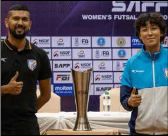
Reach Ladakh Correspondent