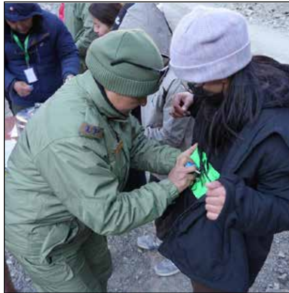
The Ladakh Autonomous Hill Development (LAHD-SSRB), in coordination with the District Administration, Leh, successfully conducted the Physical Standard Test (PST) and Physical Efficiency Test (PET) on January 7 for the posts of Deputy