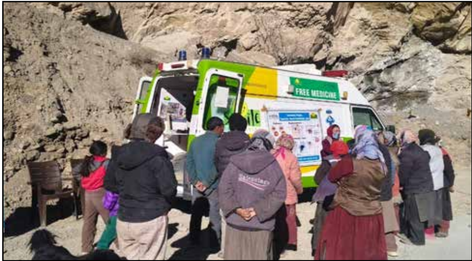
Photo Caption: During the awareness programme on myopia and cataract at Gya-Miru village.