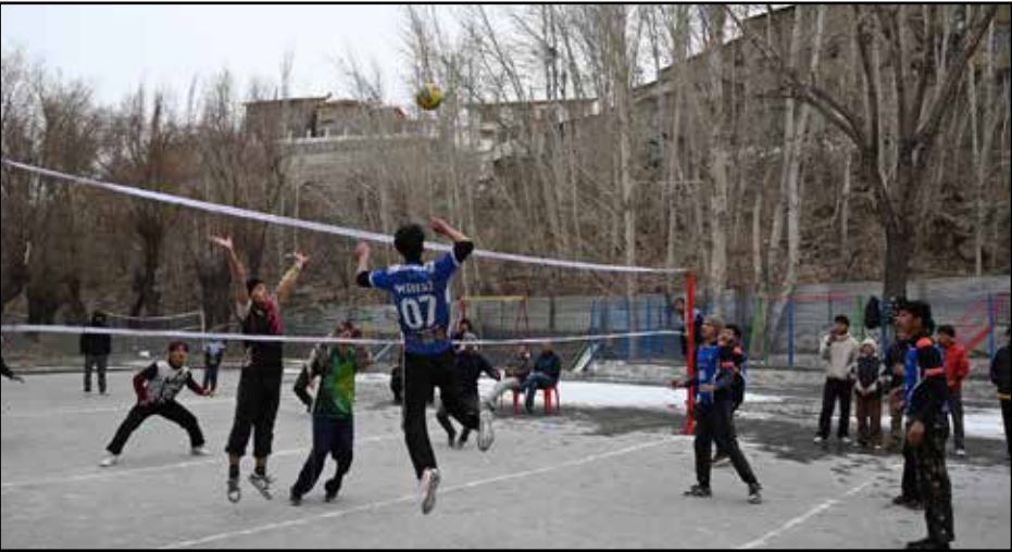
Reach Ladakh Correspondent

Sports key to discipline, drug-free youth: ADC Kargil