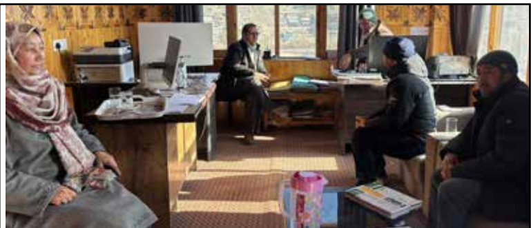
Photo Caption: Additional Deputy Commissioner (ADC) Kargil, Imteeaz Kacho, conducting surprise inspections of various government department offices.

The district administration once again appealed to the general public and shopkeepers to refrain from encroaching upon public spaces and to strictly adhere to traffic rules and regulations. It was reiterated that such drives will continue in the larger interest of road safety, pedestrian convenience, and the orderly management of traffic in Kargil town.