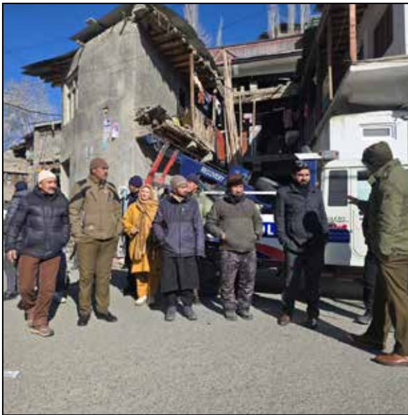
On the directions of the Deputy Commissioner, Kargil, an anti-encroachment drive was carried out in Kargil town. The drive was conducted along the stretch from Poyen Bridge to Poyen and also covered the Old Market area. During the drive, action was taken against various violations. A total of 61 challans were issued for wrong parking.