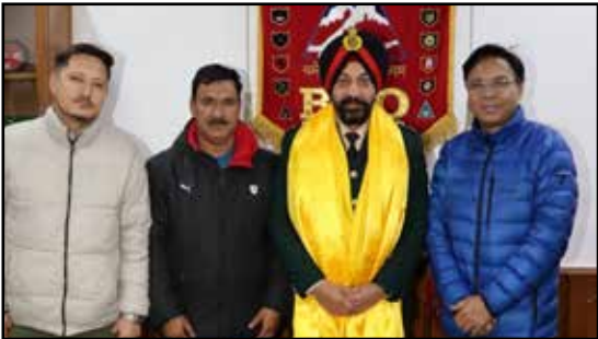
Reach Ladakh Correspondent