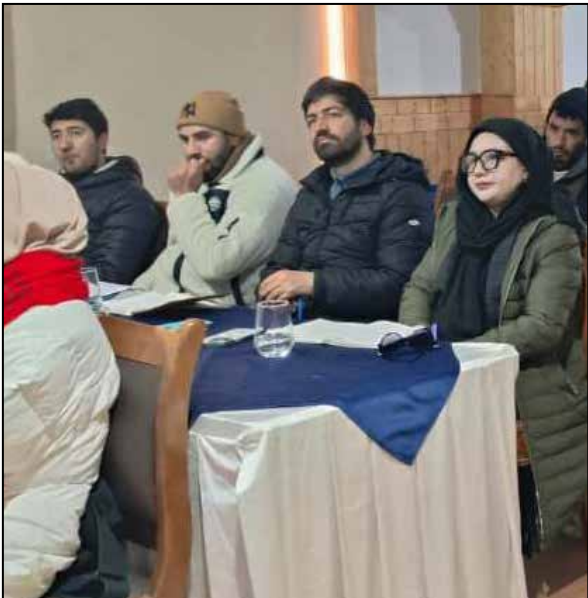
A two-day Thematic Capacity Building Training Programme under the Revamped Rashtriya Gram Swaraj Abhiyan (RGSA), organised by the Rural Development Department, Kargil, for Panchayat Secretaries (PSs) and Panchayat Accounts Assistants (PAAs) of District Kargil, concluded on January 1.