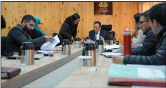
Reach Ladakh Correspondent