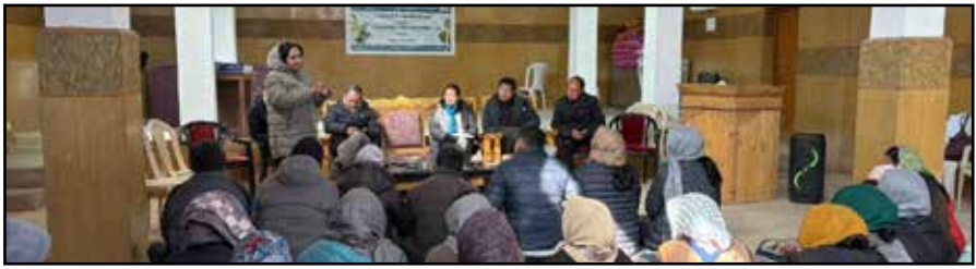
Photo Caption: During the one-day training and awareness programme at Basgo village.