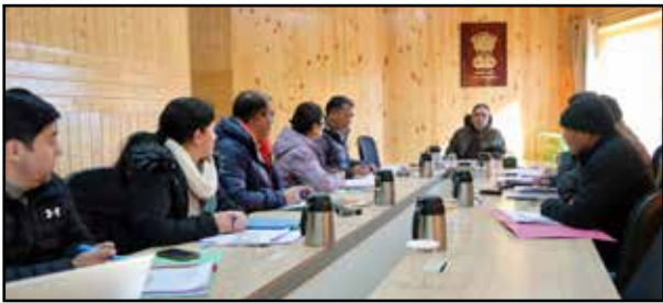
Photo Caption: Chief Secretary chairing a review meeting of the Public Works Department (PWD) and the Mechanical Engineering Department (MED).