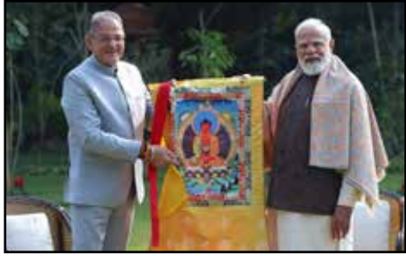
Photo Caption: Lieutenant Governor of the Union Territory of Ladakh, Kavinder Gupta with Prime Minister Narendra Modi.

Discusses issues concerning general public, developmental priorities