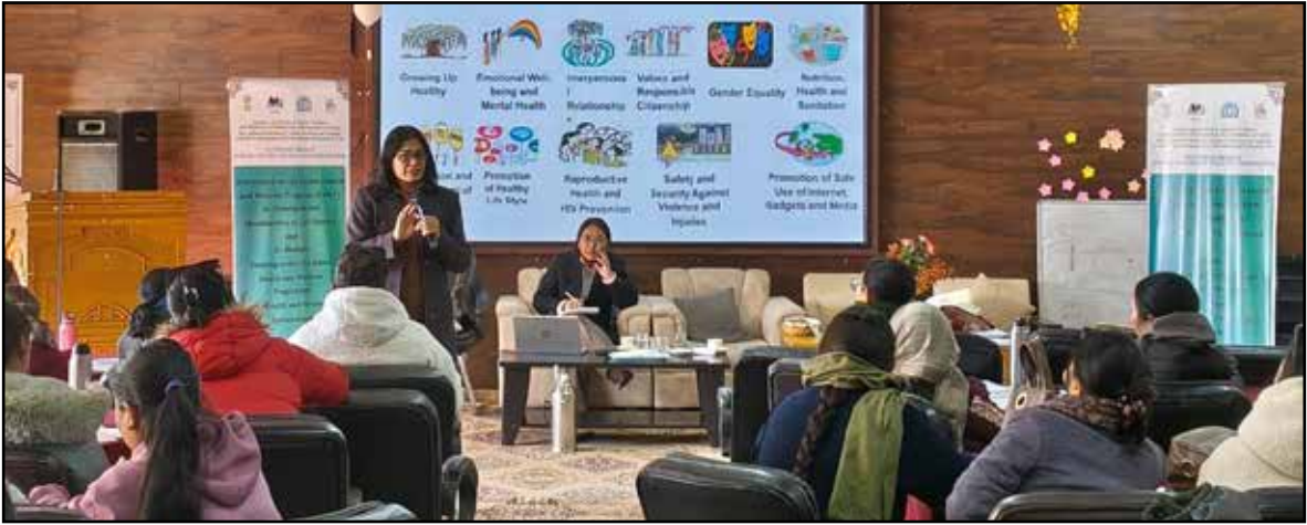
Photo Caption: During the four-day School Health and Wellness Programme (SHWP) for newly appointed School Health and Wellness Ambassadors, Physical Education Masters (PEMs), and Physical Education Teachers (PETs) at DIET Leh.

The organisers reiterated their collective commitment to continue working towards a drug-free Kargil.