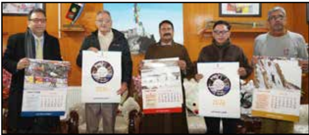
Photo Caption: Lieutenant Governor of Ladakh, Kavinder Gupta releasing the Annual Calendar titled “Yargyas Ladakh: Marching Towards a Prosperous Future” at Lok Niwas.

The workshop reflects a strong commitment towards integrating health, wellness, and education in alignment with national priorities for the well-being of children.