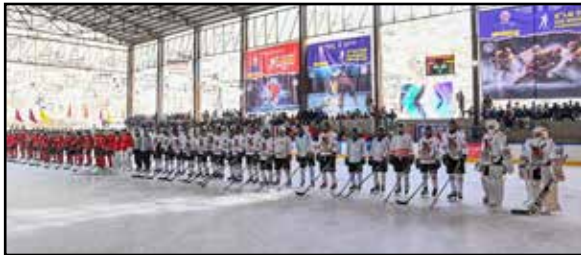
Reach Ladakh Correspondent

The meeting was described as constructive and forward-looking, with a shared emphasis on infrastructure development, employment generation, and regional growth.