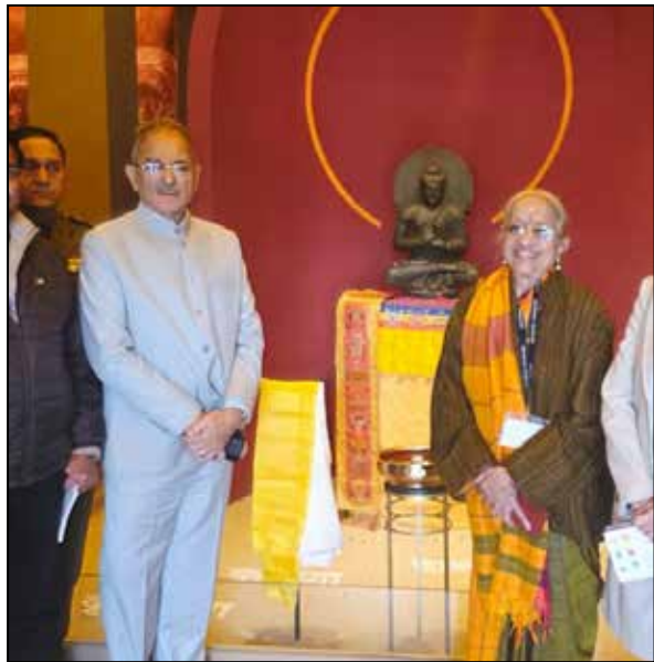
Lieutenant Governor of the Union Territory of Ladakh, Kavinder Gupta, visited the Rai Pithora Cultural Complex on January 5 to witness the Grand International Exposition of the sacred Piprahwa relics of Bhagwan Buddha. The exhibition, titled "The Light & the Lotus: Relics of the Awakened One" was inaugurated by the Prime Minister Narendra Modi.

As of now my plan is to rear livestock and help my parents but meanwhile I am also planning to try for some government job as my parents and family members also expect something more than this. One thing is very clear that I will balance my life.