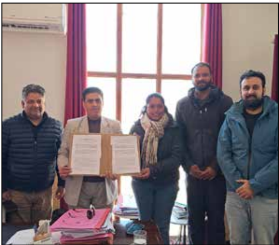
Photo Caption: During the signing of MoU with the Directorate of Industries & Commerce, Union Territory of Ladakh and Firgun Social Initiative Foundation.

The campaign reflects the administration's continued commitment to ensuring safer roads and protecting human lives across the district.