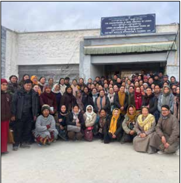
A five-day Bhuti training programme on newly framed Bhuti textbooks for foundational and primary classes concluded on December 31 at the District Institute of Education and Training (DIET), Leh.