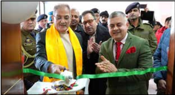
Photo Caption: Lieutenant Governor of Ladakh, Kavinder Gupta inaugurating the Office of Director of Census Operations and Citizen Registration, Jammu and Kashmir and Ladakh.

The programme was well received by the farming community, who appreciated the expert guidance and practical recommendations provided by the scientists. The initiative successfully enhanced farmers' awareness of sustainable farming practices, crop diversification and scientific management techniques tailored to Ladakh's unique environment.