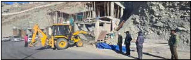
Photo Caption: Anti-encroachment drive carrying out in Kargil.

Lieutenant Governor lauded the calendar as a visual roadmap reflecting the UT Administration's people-centric vision and encouraged its wide dissemination to inspire collective efforts towards building a vibrant and self-reliant Ladakh.